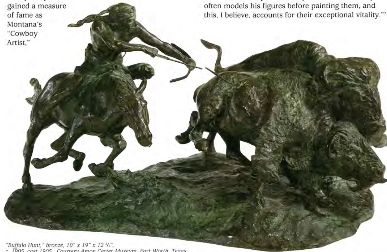
"Buffalo Hunt," bronze, 10" x 19" x 12 3/4", c. 1905, cast 1905.