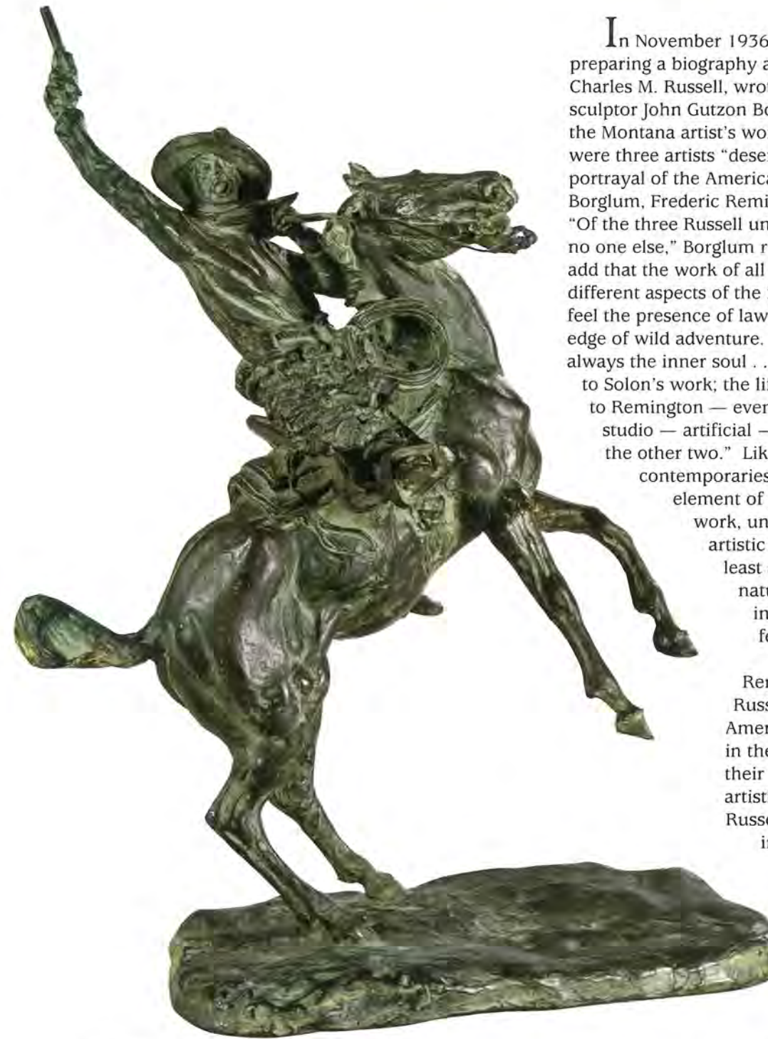
"Smoking Up," bronze, 12 3/4" x 9 3/4" x 6 1/4", c. 1903, cast 1904.