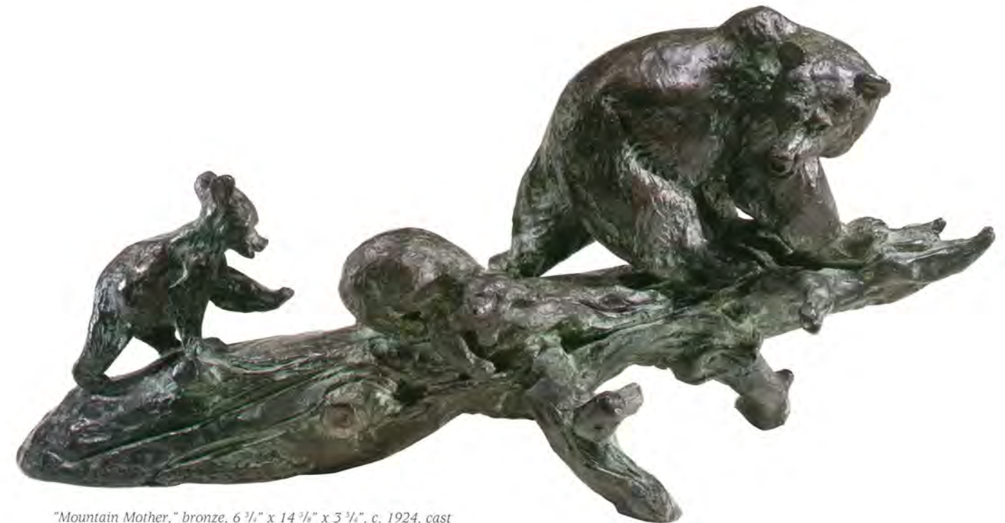
"Mountain Mother," bronze, 6 3/4" x 14 1/8" x 3 3/4", c. 1924, cast 1928.